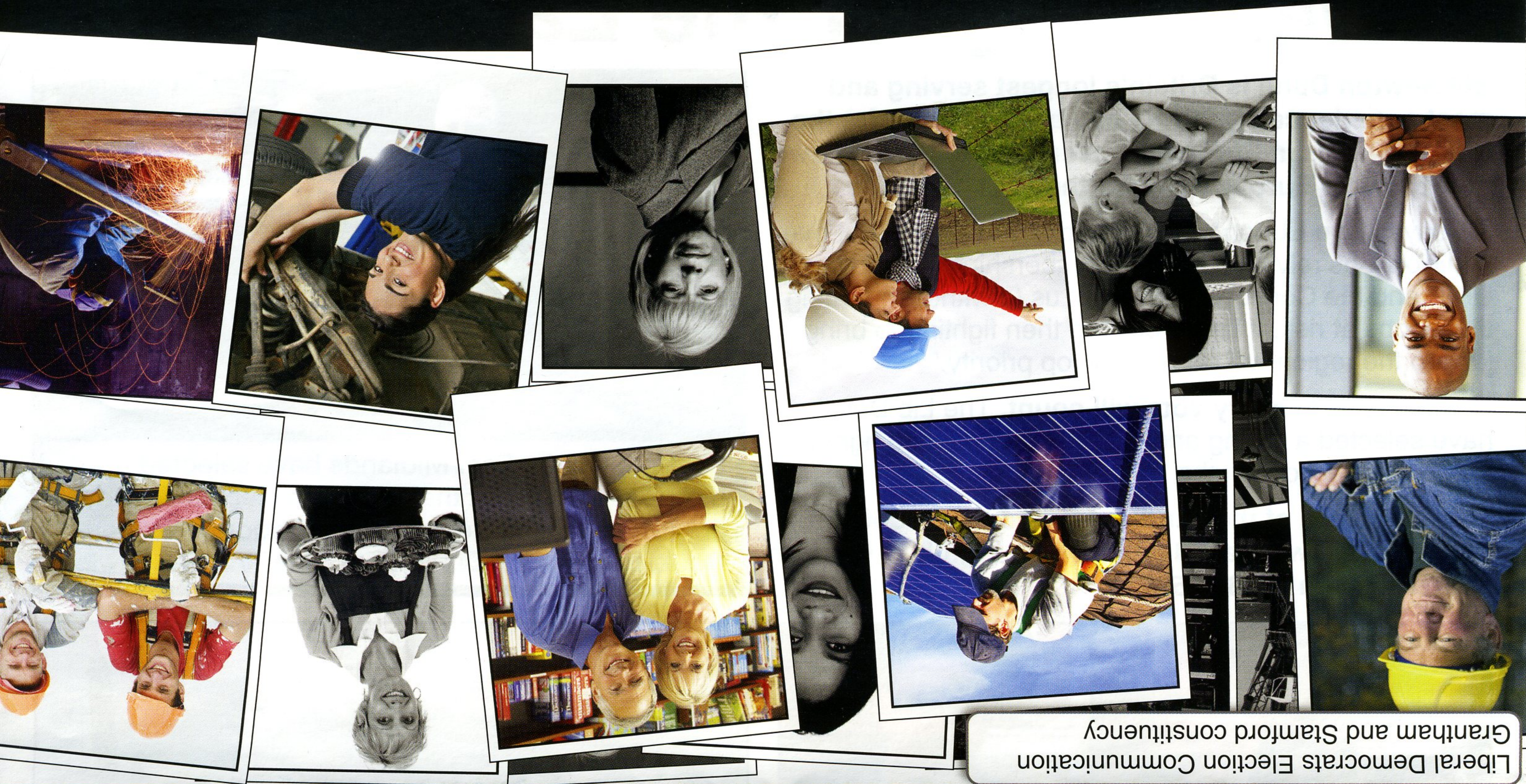
Liberal Democrats Election Communication Grantham and Stamford constituency